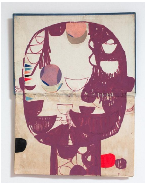
Figure 2, Sally Taylor, Confused Head 43 , (2016)

Confused Head 43 (2016, Fig.2) is a drawing that employs POSCA pen on found paper. Like many works that predate this series the ground is formed from the endpapers of discarded books that the artist has sourced from car boot sales in and around North Yorkshire. These lowly beginnings embed Taylor's drawings within the opening and closure of a now absented text. The book's spine is now a rift, crudely patched with masking tape. The deblures, in this case made from paper, are embossed by the binding and cloth beneath their surface, offering a readymade frame to which Taylor's composition must respond. The paper itself is off-white, worn with use and grease stained: evidence of its age and prior use. The book's content, hitherto protected by this cover, remains unknown to the viewer. Whether fiction or non-fiction the information contained therein is no longer the subject of the book's being. Rather the act of appropriation has emptied out its extant material and assigned to it, like Taylor's Heads , a kind of blankness that speaks volumes.