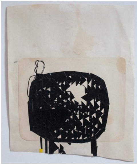
Figure 3: Sally Taylor, Head 10 , (2015)

Confused Head 43 has been drawn with a red pigment pen that UNI POSCA named 'Red Wine'. Rather than the deep luscious red of a full glass, it resembles the residue of a glass now empty and is consequently of a flatter mauve hue. What characterises this and many other heads, such as Head 10 (2015, Fig.3), is a fragile yet urgent sense of containment. In Confused Head 43 the crown and left ear formed by the heavy mauve outline are placed adjacent to the impression of the binding. The right ear, however, traverses this impression, stopping short of the blue cloth in which the book is bound. Delineated within its skull are crowds of open, empty mouths: mouths made full by a succession of downward strokes of the pen and four 'troublesome' triangles (Taylor 2011: 9). Each element clamours for the viewer's attention, jostling or talking over its neighbours, straddling the blank chasm of the ground. What this and other drawings reveal is a state of internal variance; a lack of cohesion or connection between these voices that frame an otherwise vacant subject. This cacophonous assemblage of mauve voices appear poised on the point of speeches that are never delivered; an effect which is amplified ten-fold when the drawings are viewed as they were produced, together in Taylor's studio (Fig.4). Nevertheless this tumult is resolutely confined by the lines from which the heads are formed.