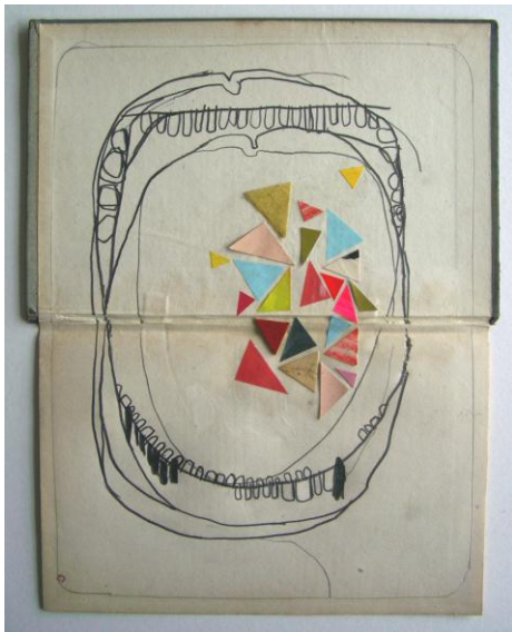
Figure 1: Sally Taylor, Wide Mouth with Triangles , (2011)

The drawings of British artist Sally Taylor (1977) are composed of heads of various descriptions: blockheads, confused heads, hysterical heads, heads with mouths and heads without, heads full of menace and heads full of glee. The pressure of these recurring motifs, which emerge from as many as two hundred drawings a day, mark out Taylor's practice as an active negotiation of repetition and difference. Norman Bryson famously characterised drawing as an act that resists the finality of the image to instead suspend a moment of 'becoming' (Bryson 2010: 150). The nuanced consistency of Taylor's prolific output exemplifies Bryson's understanding of the medium. What interests me here, however, are the performative aesthetic and material operations that make these drawings call to one another and their audience. The aim of this critical essay is to consider the inextricable relationship between form and content in the works Taylor exhibited in That Head That Head at the Rabley Drawing Centre, Wiltshire (26 September – 29 October 2016). To do so, I argue, is to situate their aesthetic as a negotiation and transformation of the social politics of making art in Great Britain at the beginning of the Twenty-first Century.