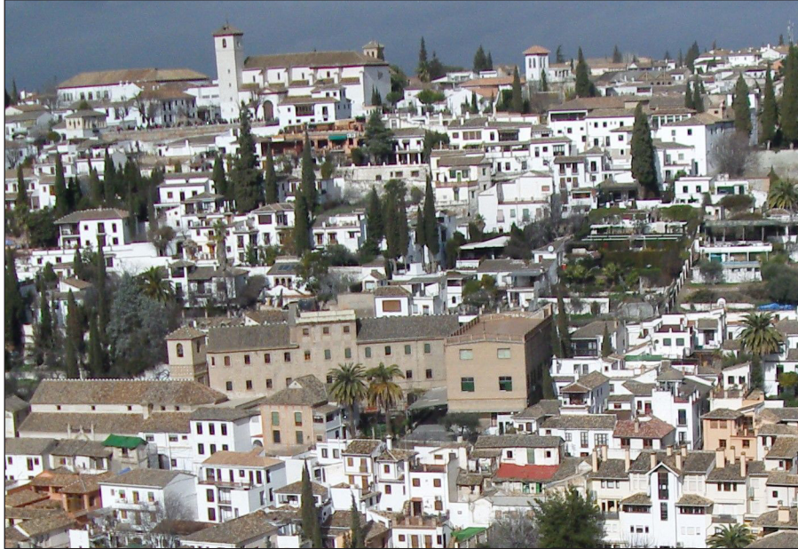
Figure 3: The Albayzín seen from Alhambra. Note the crowd on San Nicolás square, below the church spire on the upper left side. To the right we can see the shorter minaret of the Great Mosque (Author's photograph).

heritage discourse' regarding the Albayzín. It is hard to fathom in retrospect the fears voiced by locals back in 1993, that 'the construction of the mosque might have a negative effect on UNESCO's decision to declare the neighbourhood as World Heritage' (Rosón Lorente, 2008: 409). Such concerns were proved unfounded only a year later. The positive decision also disproved the residents' claim that 'the neighbourhood is known for its peasant-Gypsy [ payo-gitano ] ancestry, and the Muslim connotation it might acquire would not be true' (Rosón Lorente, 2008: 408–9). From the perspective of heritagification, the existence of a mosque in what presents itself as a Moorish district brings added value even if the edifice itself is newly built and bears no historical significance.