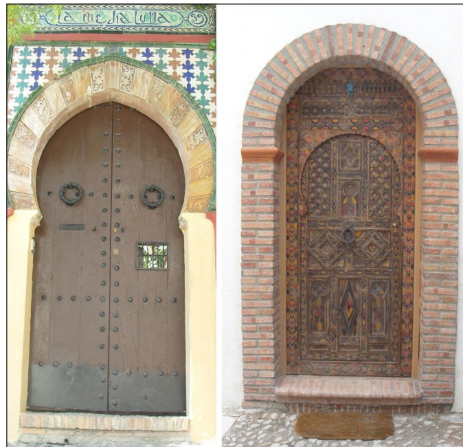
Figure 2: Moorish style doors (Author's photographs).