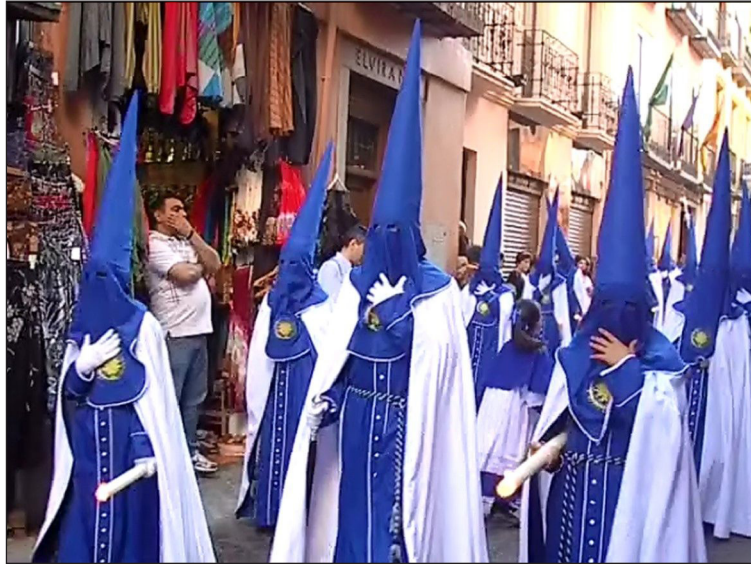
Figure 1: Palm Sunday procession along Calle Elvira.