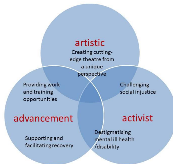
Fig. 1: Intersecting emphases of specialist theatre companies

Reviewing the literature on theatre companies for mental health service users, three different emphases of practice can be discerned: activist , artistic and advancement .